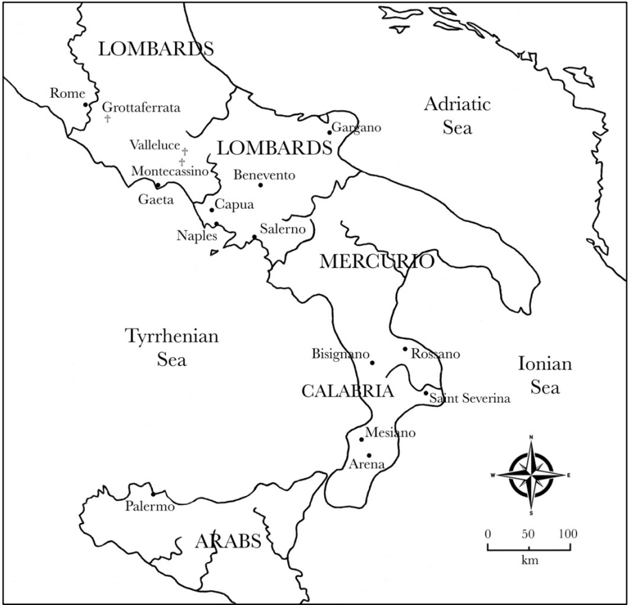
Italy at the Time of Saint Nilus